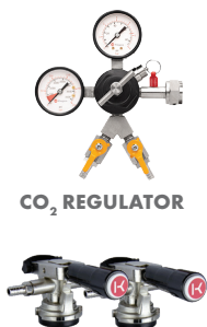
CO 2 REGULATOR