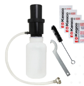
DRAFT SYSTEM CLEANING KIT