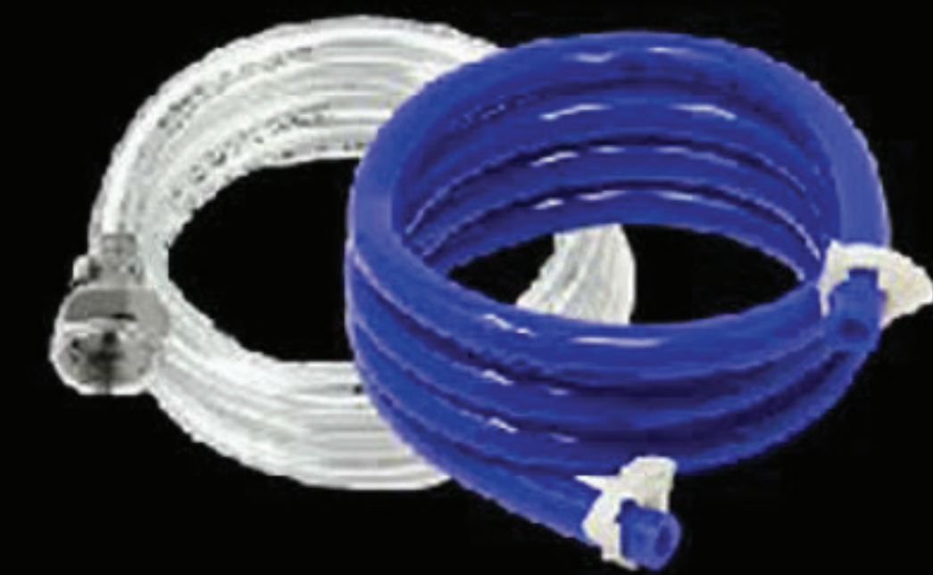
Beer & Gas Line with Clamps