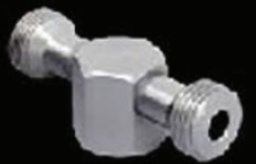
Low Profile Splitter