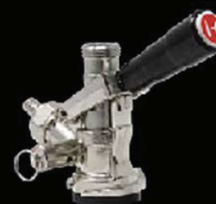
Low Profile Coupler