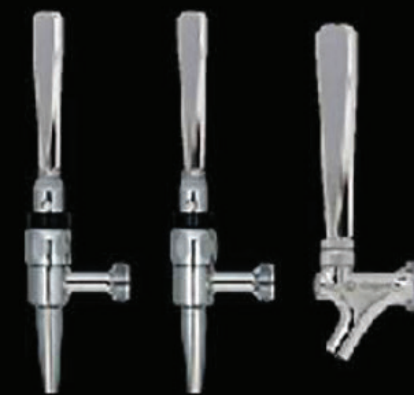
2 Nitro Faucets & 1 Standard Faucet