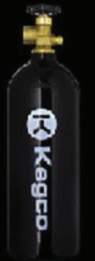
5 lb. Black Epoxy Nitrogen Tank (Empty)