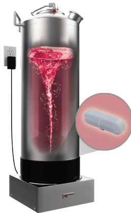
B-18-2 Beverage Tank™ on Mixing Base Beverage Tank SOLD SEPARATELY